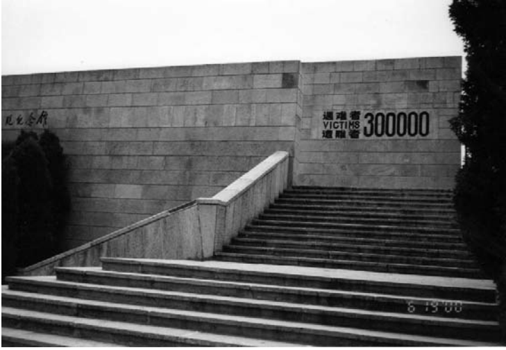
Fig. 1. The Nanjing Massacre Memorial, front wall.

figures of fatalities, gruesome pictures, and even names of villages and individuals that had fallen victim to the aggression. 53 War movies made since the 1980s graphically depicted Japanese acts of brutality, such as the Nanjing Massacre and the germ warfare conducted by Japanese Unit 731. Meanwhile, war commemoration brought Japanese atrocities to the center of national memory. The memorial to the Nanjing Massacre, the icon of Chinese war victimhood, which was completed in August 1985, included a display of numerous photographs, written documents, eyewitness testimonies, and even human skeletons. The inscription on its front wall declared “VICTIMS 300,000” (Beijing’s official estimate of the massacre’s fatalities), while the inscription on the inner wall instructed visitors “Never forget national humiliation” ( wu wang guochi ) (see figures 1 and 2). Similar museums were built at other sites of Japanese atrocities throughout the country and designated as centers for patriotic education. Chinese scholars were also encouraged to conduct deeper investigation of Japanese atrocities and publish their research. 54